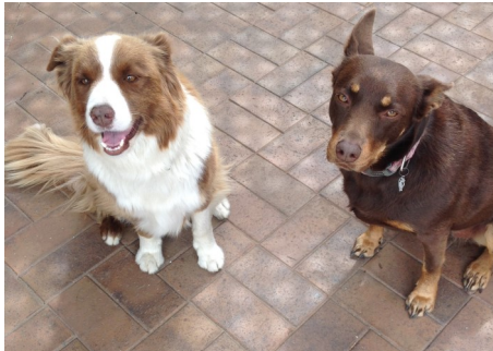
Coco & Jazzy

Puppy, Grades 1 & 2 9.00 am—9.45 am Grades 3, 4 & Advanced 10.15 am—11 am