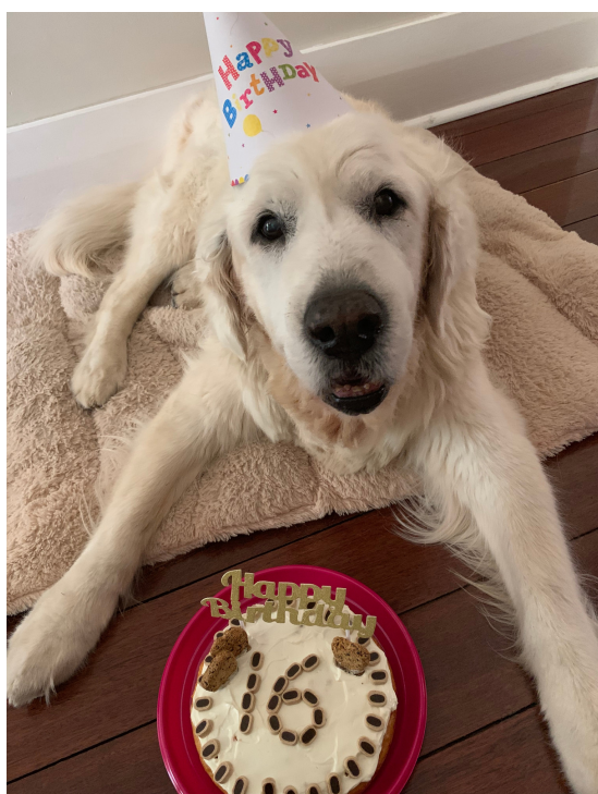
Happy Birthday Jazz 16 years young on 5th April